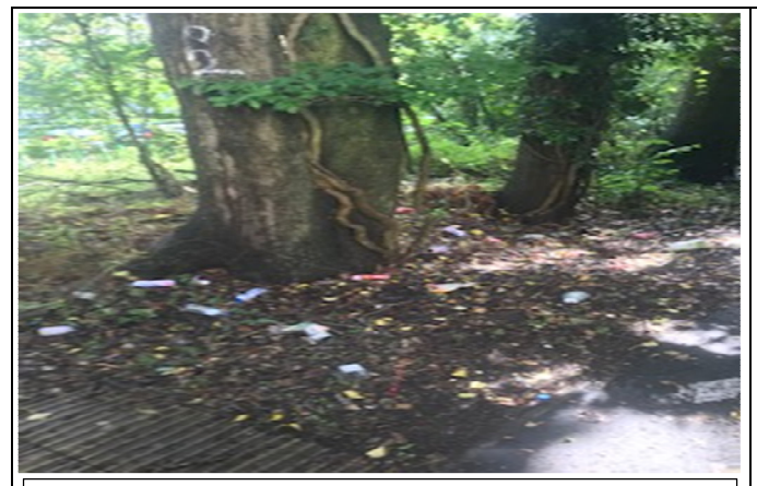
Before and after along the pathway outside Welland.