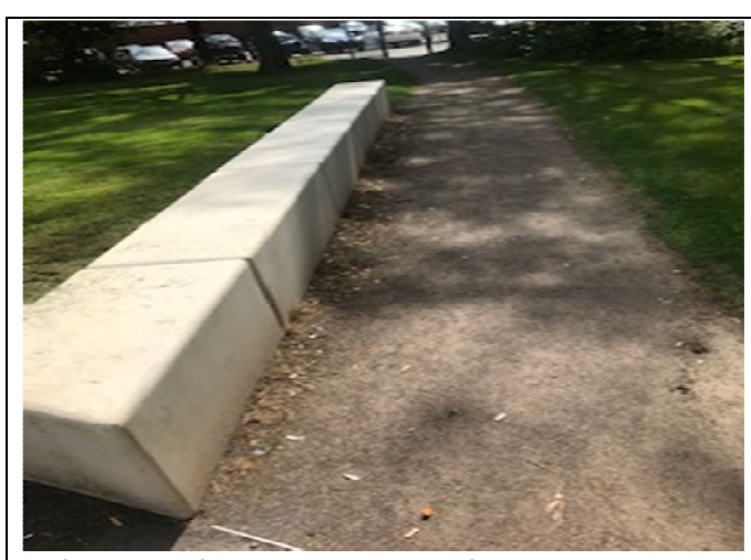
Before and after at the Terrace after using the Billy Goat.