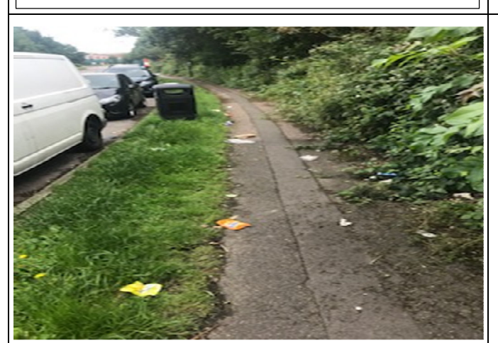
We've moved a bin from James Watt Way where it clearly wasn't being used properly.