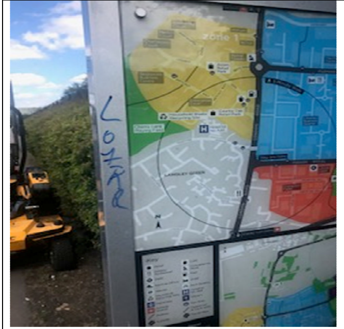
Before and after of graffiti sign clearing.