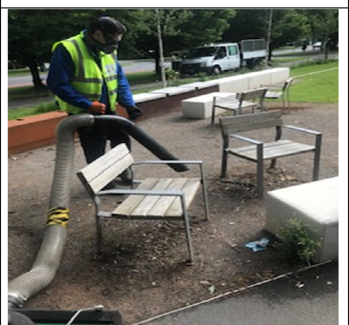
Using the Billy Goat in the Terrace.