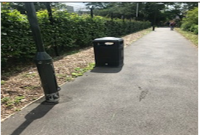
We've moved it to the pathway outside Welland and it seems to be working.