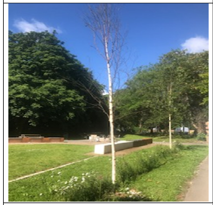
A silver birch tree that has unfortunately died in the Terrace.